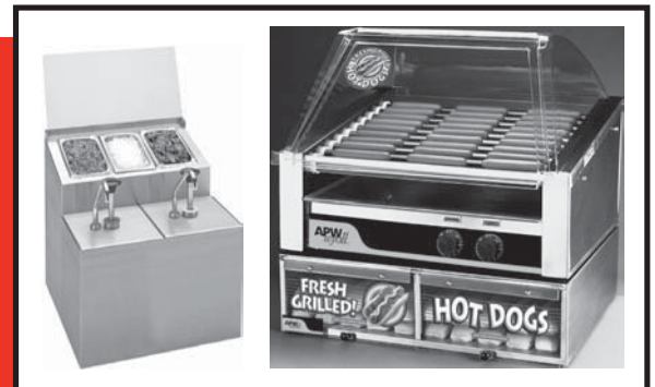
Hot Dog Package